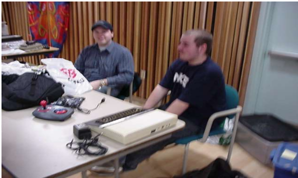
Two Guys from Calgary